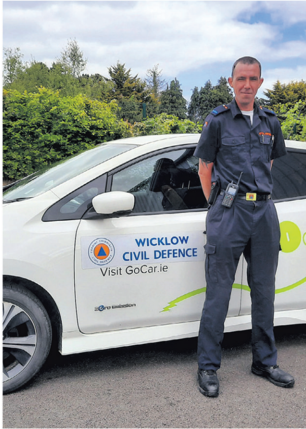
Wicklow County Council have redeployed one of the fully electric GOcars to be used by Wicklow Civil Defence. Our Civil Defence volunteers are very busy assisting people in the communities during this pandemic.