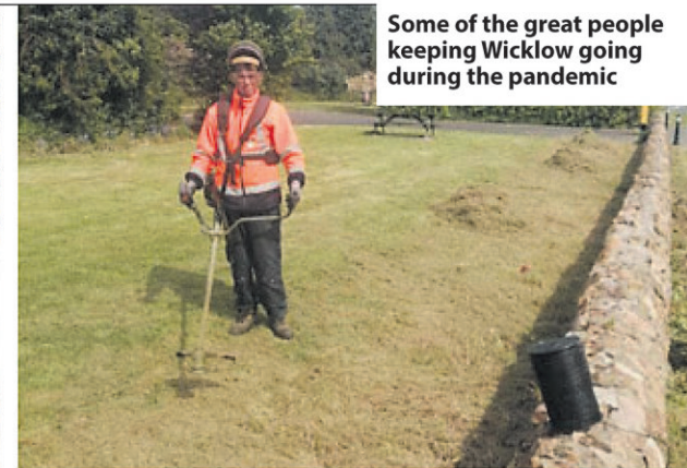
Some of the great people keeping Wicklow going during the pandemic