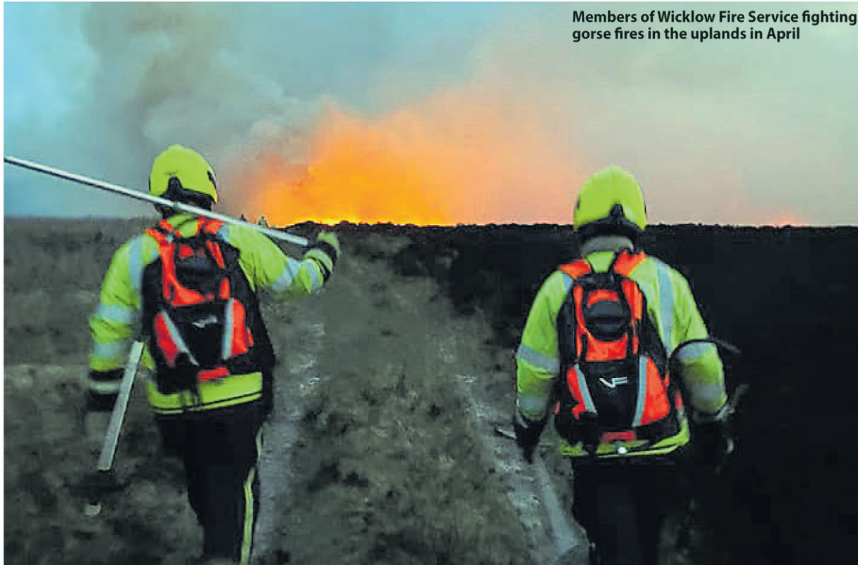
Members of Wicklow Fire Service fighting gorse fires in the uplands in April

We are very conscious of the challenges COVID-19 has presented for us all, individuals, families and communities and the impact it has had on our daily lives. Normal life as we knew it has temporarily ceased to exist and the impact on the more vulnerable in our society has been even greater. I would like to thank everyone for their efforts in minimising the risk of spreading COVID-19 and for their co-operation adhering to National advice. I would especially like to thank those who potentially put themselves in harms way daily